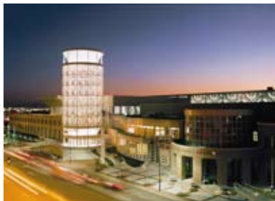
Salt Palace Convention Center

is the Preregistration deadline for money-saving registration discounts for ITEA's Salt Lake City conference , taking place February 21-23, 2008. Register early and save!